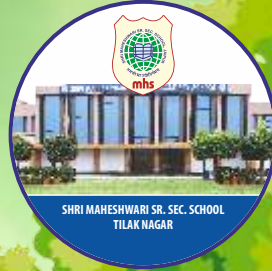
SHRI MAHESHWARI SR. SEC. SCHOOL TILAK NAGAR