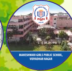
MAHESHWARI GIRLS PUBLIC SCHOOL, VIDYADHAR NAGAR