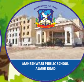
MAHESHWARI PUBLIC SCHOOL AJMER ROAD