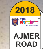
2018 AJMER ROAD