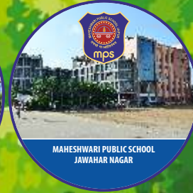
MAHESHWARI PUBLIC SCHOOL JAWAHAR NAGAR