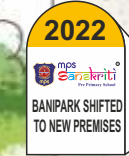
2022 BANIPARK SHIFTED TO NEW PREMISES