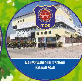
MAHESHWARI PUBLIC SCHOOL KALWAR ROAD