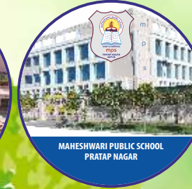
MAHESHWARI PUBLIC SCHOOL PRATAP NAGAR