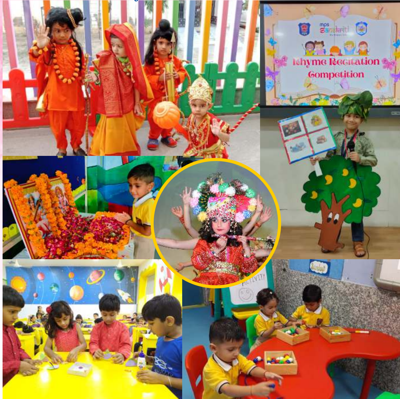
MAGIC MOMENTS! WHERE DREAMS AND REALITY INTERTWINE.