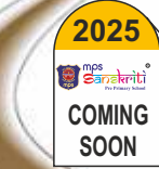
2025 COMING SOON