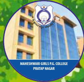
MAHESHWARI GIRLS P.G. COLLEGE PRATAP NAGAR