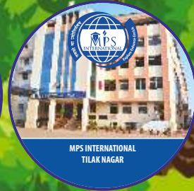
MPS INTERNATIONAL TILAK NAGAR