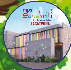
mps Sanskriti Pre Primary School JAGATPURA

Since the inception in the year 1926, the Education Committee of the Maheshwari Samaj (ECMS) has been towering in the field of education with its inimitable and transcendent institutions in Jaipur. "A clear vision, backed by definite plans, gives a tremendous feeling of confidence and personal power."