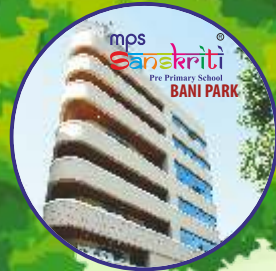
mps Sanskriti Pre Primary School BANI PARK